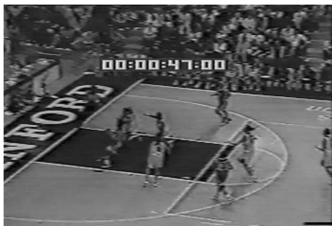
Figure 2. Video image from a single-camera sequence with poor quality. The right leg (partly hidden) of the player to the left, holding the ball, is injured. The video frame is captured at initial contact of the right foot.

of injury, we used the median instead of the mean because 1 analyst in several cases estimated the injury to occur much later than did the rest of the group. Results are reported as the means with SDs and ranges across cases. Finally, the SDs across analysts are reported as a measure of intertester reliability for each variable.